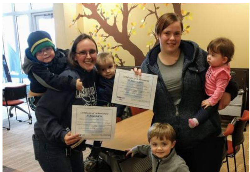
Pictured: Barry County Baby Cafe moms and their children pose with their certificates for meeting their breastfeeding goals!

"IT'S SO NICE TO LEARN MORE ABOUT [BREASTFEEDING AND] KNOW THAT OTHERS HAVE BEEN DOWN A SIMILAR PATH. HOPE I GET THE CHANCE TO ATTEND MORE MEETINGS!"