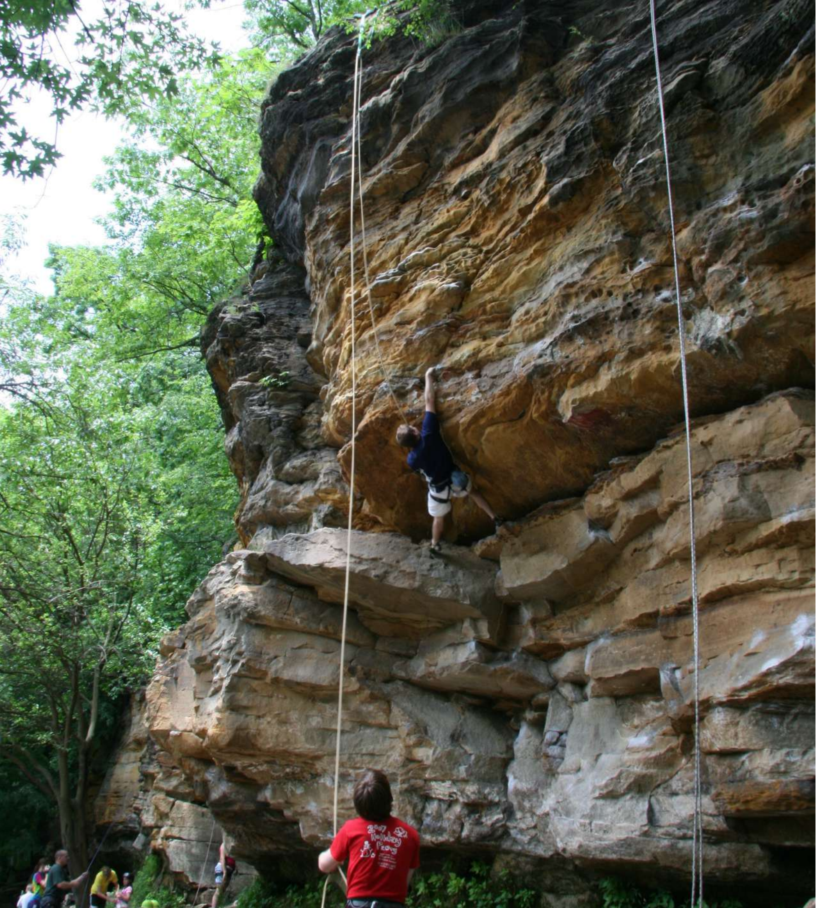
The Ledges, Grand Ledge, MI